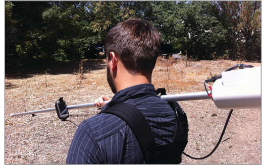
G-857 and Optional Garmin® GPS

The G-857 provides a reliable, low-cost solution for a variety of magnetic search and mapping applications. Single keystroke operation means the G-857 can be operated by non-technical field personnel and used in teaching environments. The G-857 uses the well-established proton precession method, allowing accurate measurements to be made with virtually no dependence upon variables such as sensor orientation, temperature or location. The unit provides a repeatable absolute total field magnetic reading, traceable to the National Institute of Standards and Technology.